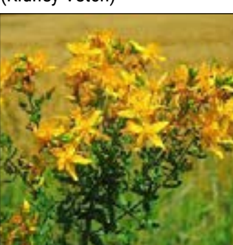
Hypericum perforatum (St Johns Wort)