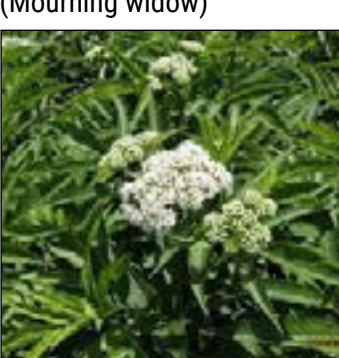
Sambucus ebulus (Dwarf elder)