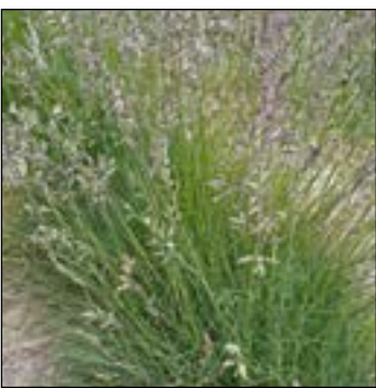
Festuca ovina (Sheeps Fescue)