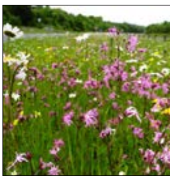
Silene flos-cuculi (Ragged Robin)