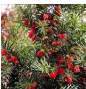
Taxus baccata (Yew)