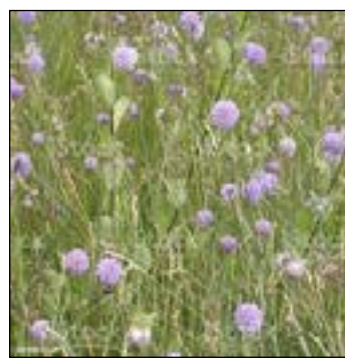
Succisa pratensis (Devils Bit)