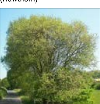
Salix caprea (Pussy Willow)