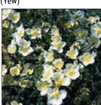
Rosa spinosissima (Burnet rose)