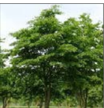
Fagus sylvatica (Beech)