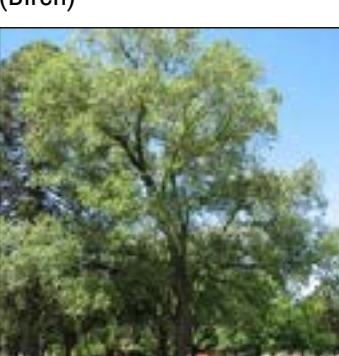
Ulmus minor (Field Elm)