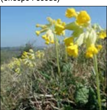
Primula veris (Cowslip)