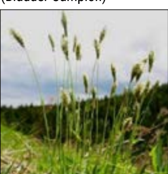
Anthoxanthum odoratum (Sweet Vernal Grass)