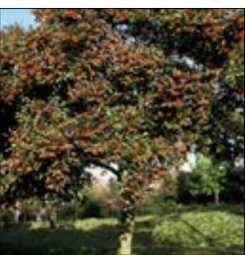
Crataegus lavellei (Hawthorn)