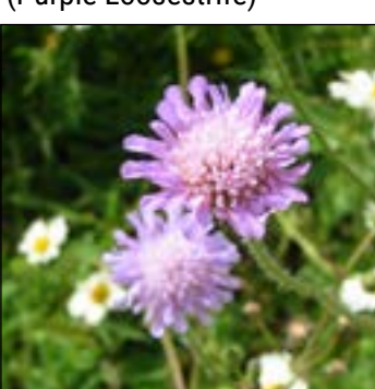
Knautia arvensis (Field Scabious)