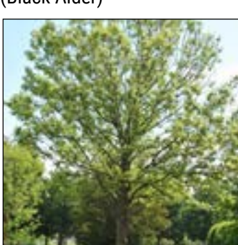
Fraxinus excelsior (Ash)