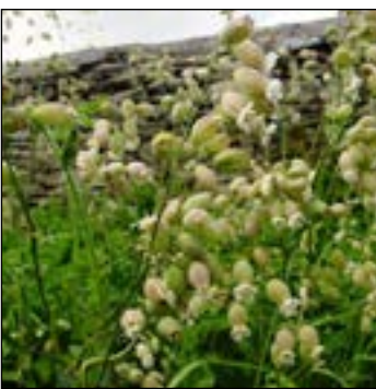
Silene vulgaris (Bladder Campion)