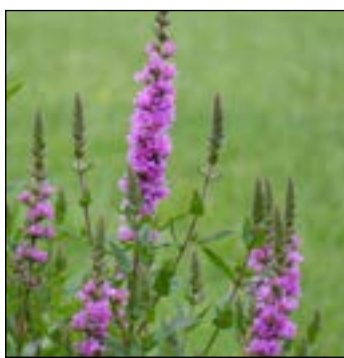
Lythrum salicaria (Purple Loosestrife)