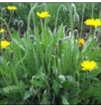
Leontodon hispidus (Rough Hawbit)