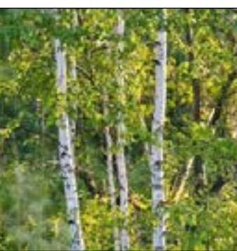
Betula pendula (Birch)