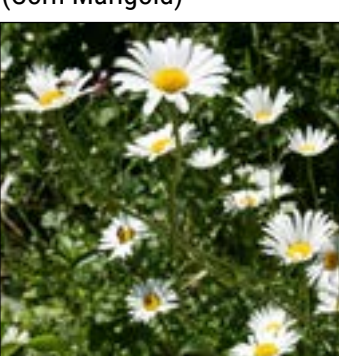
Leucanthemum vulgare (Ox-eye Daisy)