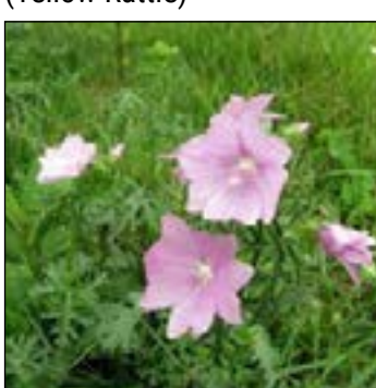
Malva moschata (Musk Mallow)