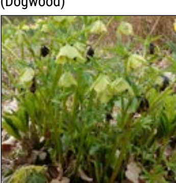
Helleborus viridis (Green hellebore)