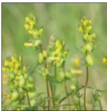
Rhinanthus minor (Yellow Rattle)