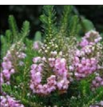
Erica vagans (Heath)