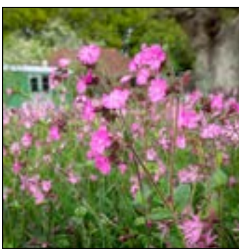
Silene dioica (Red Campion)