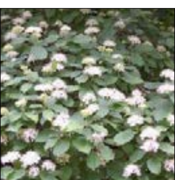
Cornus sanguinea (Dogwood)