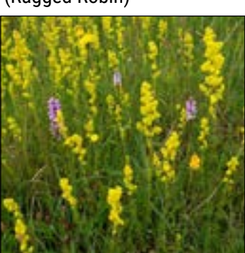
Galium verum (Ladies Bedstraw)