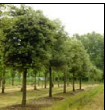
Quercus ilex (Holm Oak)