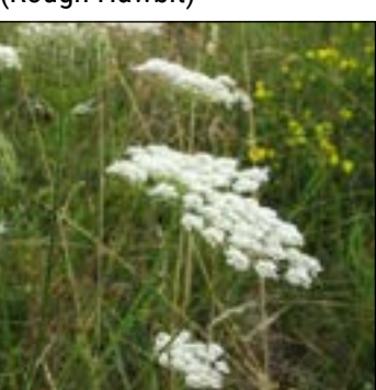
Daucus carota (Wild Carrot)