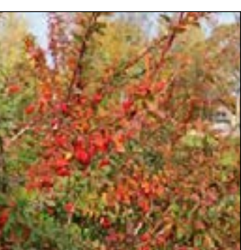
Berberis vulgaris (Barberry)