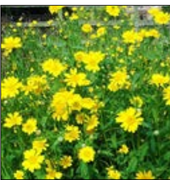
Glebionis segetum (Corn Marigold)