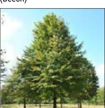
Tilia cordata (Lime)