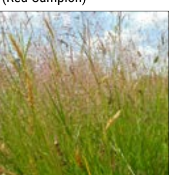
Agrostis capillaris (Common Bent)