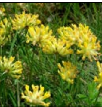
Anthyllis vulneraria (Kidney Vetch)