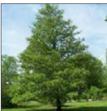
Alnus glutinosa (Black Alder)