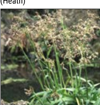
Luzula sylvatica (Great wood-rush)