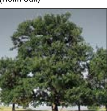
Quercus robur (Common Oak)