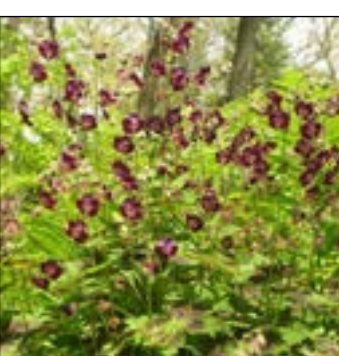
Geranium phaeum (Mourning widow)